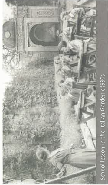
School lesson in the Italian Garden c1930s